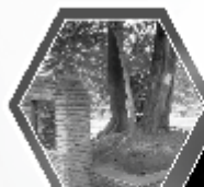
Chandrashekar Azad Park

AMA Convention Centre, Stanley Road, Prayagraj (Allahabad)