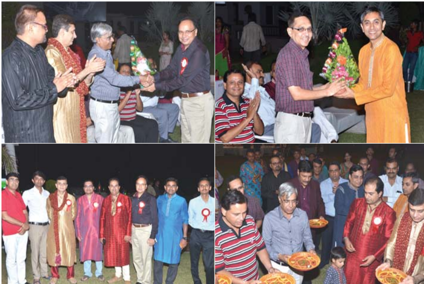
Navratri Celebration Rajkot Branch