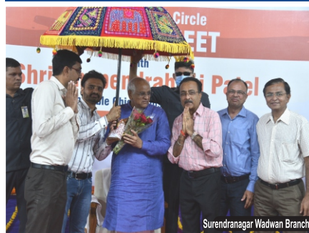
Surendranagar Wadwan Branch