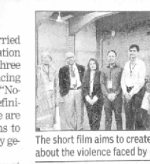
The short film aims to create awareness about the violence faced by doctors