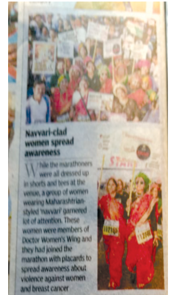
Navvri-clad women spread awareness While the marathons were all dressed up in shorts and tees at the venue, a group of women wearing Maharashtra-styled 'navvri' garnered lot of attention. These women were members of Doctor Women's Wing and they had joined the marathon with placards to spread awareness about violence against women and breast cancer