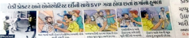
લેડી ડોક્ટર અને એનર્જીટર દર્દીની સાથે SVP ગયા હોવા છતાં સગાંને હુમલો કરી દેવા પોલીસને જાણ થઈ હતી.