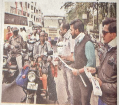
મેડિકલ એસો. દ્વારા ગણામાં બાંધવાની પટ્ટીનું વિતરણ

ભાવનગર મેડિકલ એસોસિએશન દ્વારા ઉત્તરાયણ માં દોરી ગણા માં આવવા નાં લીધે થતા અકસ્માત નું નિવારણ કરવા માટે શહેરનાં વાહનચાલકોને ગણા માં બાંધવાની પટ્ટી નું વિતરણ કરવામાં આવ્યું હતું. જેથી ઉત્તરાયણ માં ગળે પટ્ટી બાંધીને વાહન ચલાવવાથી અકસ્માત નો ભય ઘટાડી શકાય. શહેરનાં ચાર રસ્તાઓ પર વાહનચાલકોને અને પાછળ બેસેલા બંને વ્યક્તિ ને પટ્ટી આપવામાં આવી હતી